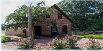
Historic Whiskey Bonding Barn, Molena, GA